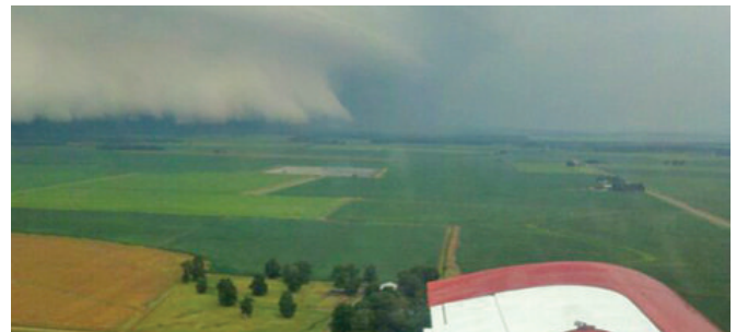
Stan trying to out run a fast moving storm.

904 E. Race St. • Searcy • 501.279.9929 exitnaturalstaterealty.com