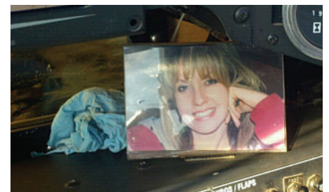
Sue's photo on the airplane's dashboard.